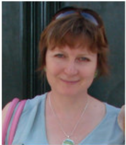
Julie Andrews Finance