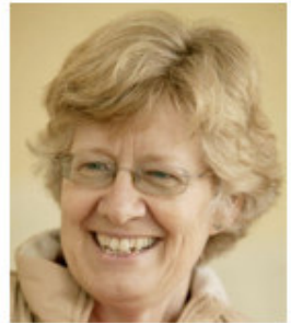
Rena Downing Fabric